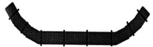
Sandbags are placed along the contour of the slope.

Biodegradable bags are filled with on site soil and bedded in a shallow trench forming a continuous barrier along the contour (across the slope) to intercept water running down the slope.