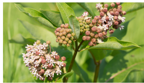
Milkweed ( Aesclepias ssp.)