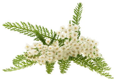
Common yarrow ( Achillea millefolium )