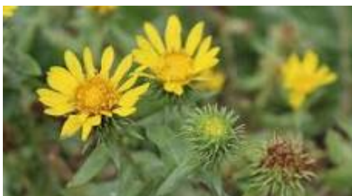
Great Valley Gumweed ( Grindelia camporum )